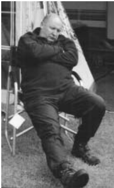
Our Vice Chairman gives his undivided attention to the meeting!