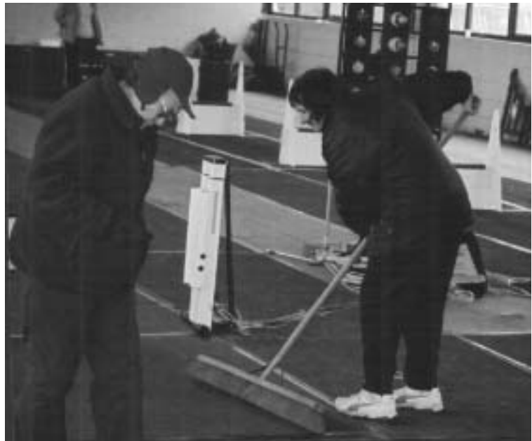
Our new Treasurer tries to balance the books by checking the sweeping up for any loose change!!!